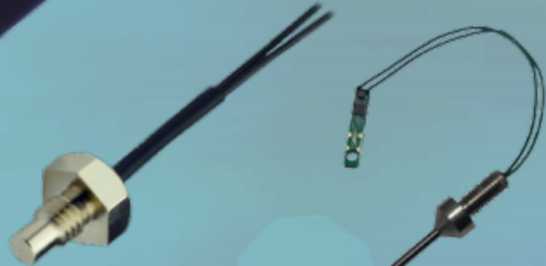
Calibration Sensor Version